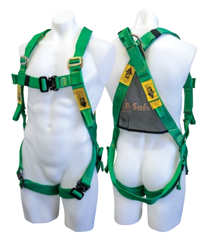
HOT WORKS CONFINED SPACE HARNESS - QUICK BUCKLE