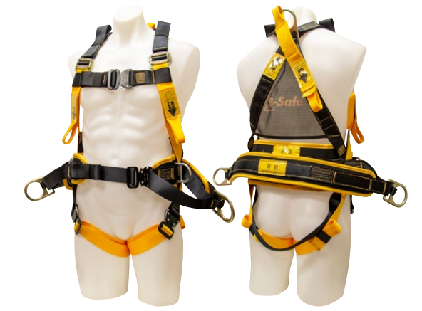
SWIFT CONFINED SPACE HARNESS WITH BACK SUPPORT - QUICK BUCKLE