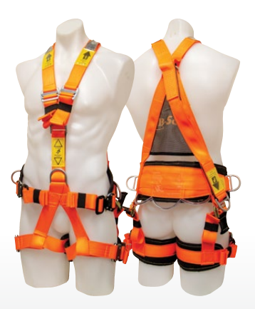
WORKER HARNESS - QUICK BUCKLE RELEASE