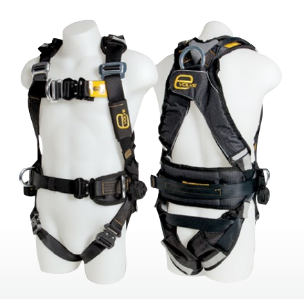
POLE WORK HARNESS - QUICK BUCKLE RELEASE