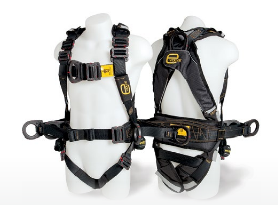
UTILITIES DIELECTRIC HARNESS - QUICK BUCKLE RELEASE