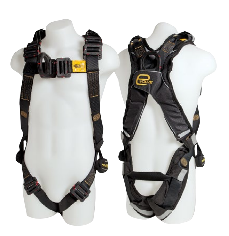
CONFINED SPACE DIELECTRIC HARNESS